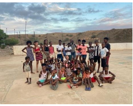
Figure 8 – Treasure hunt activity organised by a Portuguese Volunteer in 2021