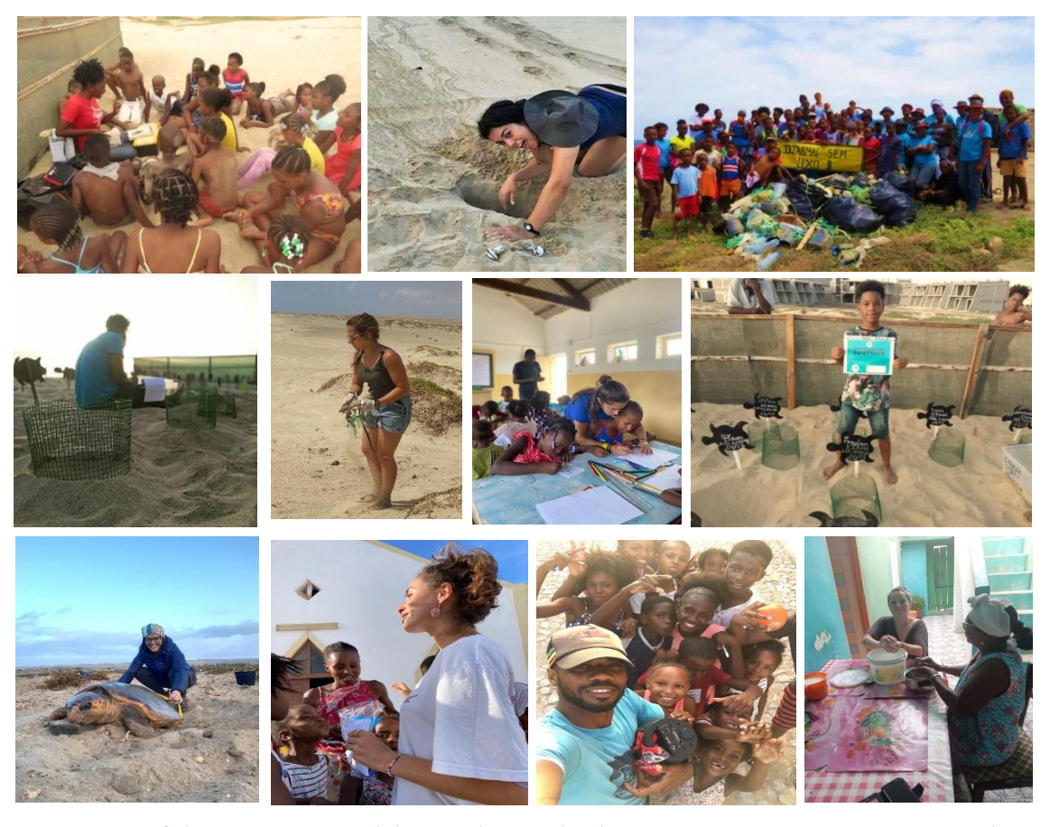
Figure 14 - Some of the protection teams' duties: educational and awareness activities, morning census and nesting beach clean-up, and nest adoption.

Protection teams cover the distance between village and beaches by foot. They spend the night at the beaches and come back to the villages only early in the morning. Turtle protection work is mainly a night-time position, as the loggerhead turtles normally nest at night (exceptions are not rare though!). Team members spend the entire night at the beach and should be comfortable in taking a nap (on the sand, in sleeping bags) during the patrol breaks and in turns, in order to handle the long patrol hours, every night, for several weeks.