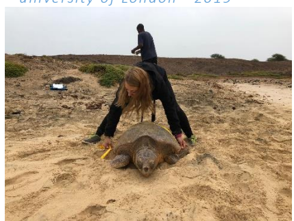
Figure 9 – Portuguese volunteers - 2021