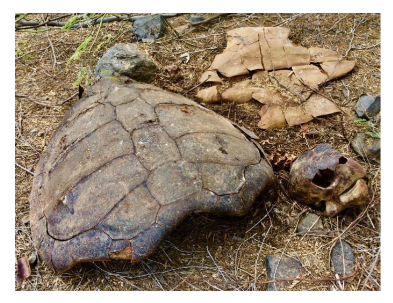
Figure 1 Carapace of a loggerhead female.

The loggerheads in Maio are threatened mainly by poaching of females on nesting beaches, captures at sea and egg collection by humans for consumption. Additionally, loss of nests by natural (tides, storms and crab predation) and anthropogenic (sand extraction for construction, vehicles on nesting beaches) factors and marine debris on the nesting beaches and in the sea, can negatively affect the survival of this species. In contrast with the other important islands for sea turtle nesting, Maio has not yet been affected by touristic development and its beautiful coast remains practically untouched.