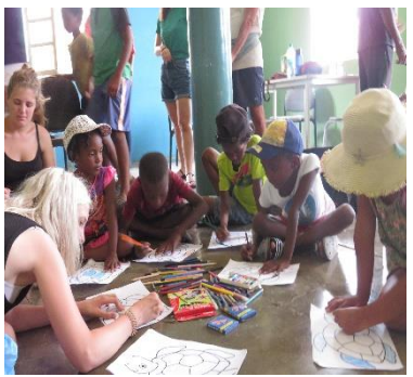
Figure 6 - Awareness and painting activity with students from Queen Mary university of London - 2019