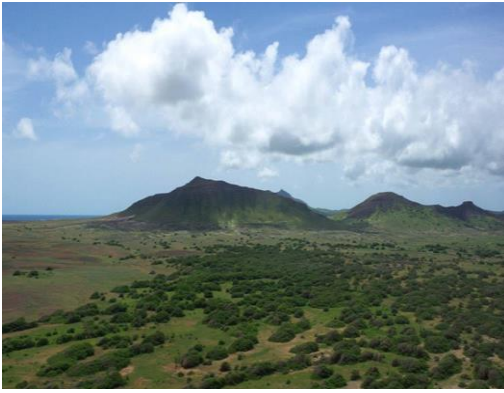
Figure 15 - Landscapes of Maio - Dunes and mountain

Volunteers will have the unique opportunity of closely experiencing the Cabo Verdean lifestyle and culture, while spending the nights walking along stunning beaches under the stars in company of a great team of nature lovers. It is a great chance to learn about sea turtles and see for yourself all the details of the nesting phases under the moon light (or red head torch!). Despite the intense night work, there will be enough free time to rest during the day. You can also walk around and visit villages and beaches, read a book (don't forget to bring them along!), climb mountains, go for a swim in the turquoise sea, listen to music and play football with your neighbours — or just chill at the beach or under the fresh shade of a tree.