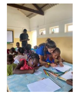
Figure 11 – Painting activity with children from Pilão cãos, organised by Portuguese volunteers, in 2022