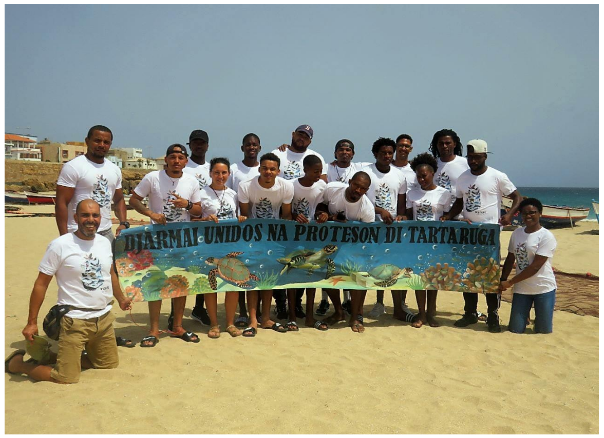
Figure 12 – Turtle Protection Tea, in 2017 and 2022